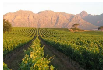
Local wine tour