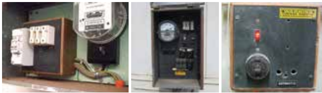
Figure 1: Asbestos based resin mounting boards used across Australia.

Main electrical meters, fuse boxes and boards hold a number of asbestos-containing materials like based resin board; generally black in colour with brand names such as "Ausbestos" or "Zelemite" stamped on them. Behind these boards can be insulating asbestos side, back and top panels of asbestos cement sheet, asbestos insulation board, asbestos millboard or even a combination of them. Asbestos millboard is like a paper or cardboard form of asbestos. (See figures 4 & 5)