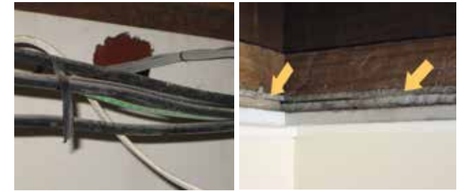
Figure 7: Take appropriate safety precautions including P.P.E. when running cables through asbestos and do not leave an asbestos mess for next time. The ongoing renovation boom in Australia has resulted in asbestos-containing materials being hidden to be found later by another tradesperson.