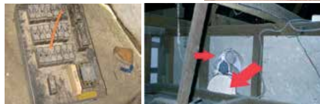
Figure 6: Discarded asbestos waste onsite. Often you will find asbestos debris discarded such as this asbestos insulation board ceiling pieces left lying in the roof, discarded electrical backing board, entire fuse box and asbestos cement pieces where a ceiling extractor has been installed.