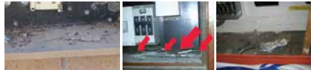
Figure 5: Asbestos millboard, asbestos resin board debris and asbestos insulation board debris in the bottom of electrical cabinets.

In older electrical cabinet/boxes, quite often there is already asbestos-containing debris inside from previous drilling/ installation work. This can be in the form of asbestos-resin board dust, asbestos millboard debris, asbestos cement or asbestos insulation board debris. This can be particularly dangerous as opening the box or cabinet will be enough to cause asbestos fibres to become airborne and potentially "in your face".