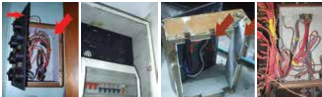
Figure 2: Asbestos cement and asbestos insulation mixed linings inside the electrical box itself.