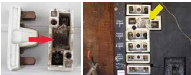
Figure 3: Woven asbestos textile fuse linings are common for large and small fuses.